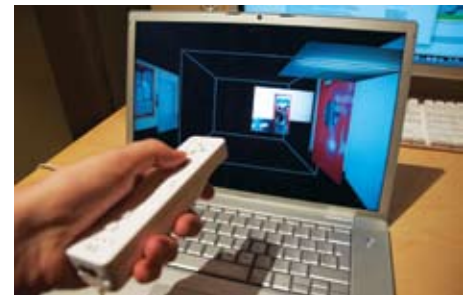
The prototype Vlex game from C&T

Find out more: candt.org/addverb artscouncil.org.uk/yppt