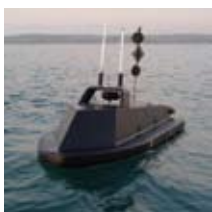
QinetiQ are world leaders in robotic systems, like this robot stealth boat which can venture into dangerous waters.

Annette Smart, QinetiQ's STEM outreach manager, adds "The whole exercise captured the imagination of all the students with 100%