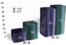
History GCSE results (%)