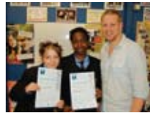
Two young Arts Award achievers receiving their certificates.

Want to find out how to get students motivated about their creativity and get it accredited? candt.org/artsaward