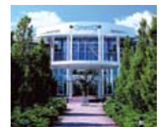
QinetiQ's research facility in Farnborough, Hampshire, to be visited by participating teachers.