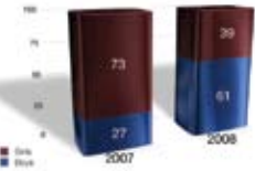
Gender mix in GCSE uptake