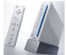
The Wii has revolutionised the gaming world through its handheld accelerometer controls

Whilst video gaming is a multimillion dollar industry, it's rare for young people to be involved in the design an development of a video game in such a fascinating way.